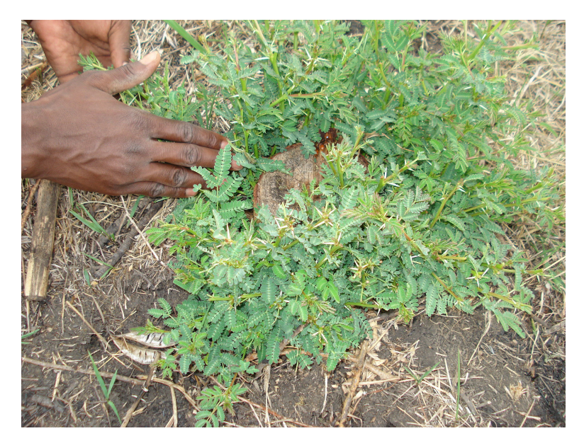
Figure 3.1: Resprout of Acacia polycantha after coppicing (Nellie Odour, KEFRI)

An addition to this list, the Prosopis is now being promoted by the Kenya Forest Service as a source of woodfuel in order to manage the spread of the invasive species.