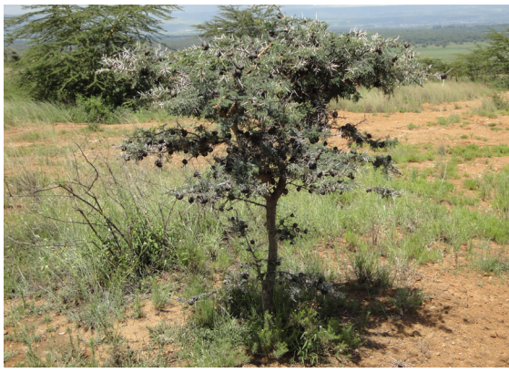
Figure 2.3: Acacia drepanolobium tree growing in the wild

The study found that the total harvestable dry woody biomass was 18.97 metric tons Ha-1 for a 14-year-old stand. Given the coppicing rates of the Whistling thorn, the study suggested a minimum of 12-14 year harvest cycle. Being a relatively small tree, Acacia drepanolobium is ideal for sustainable charcoal production since no expensive machinery is needed for harvesting (machetes and axes suffice) and it does not have any special handling needs.