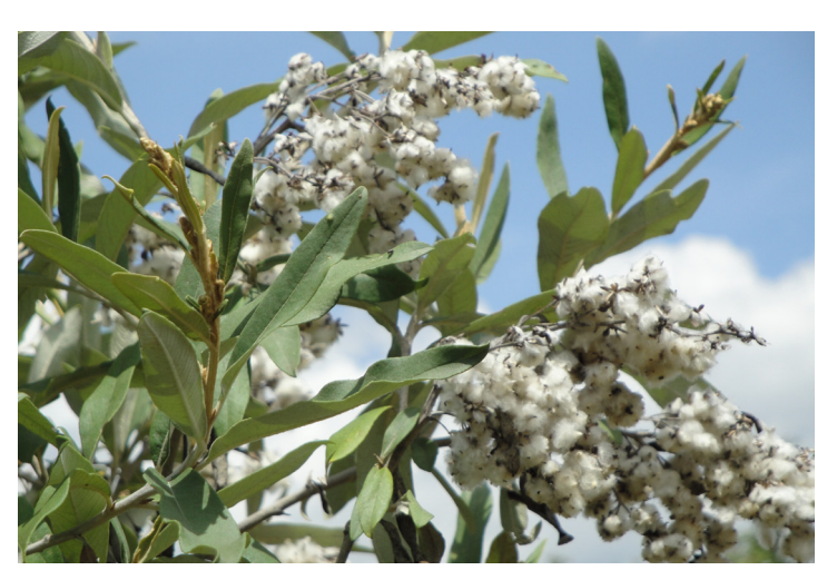
Figure 2.1: Tarchonanthus camphoratus (Leleshwa) in flower (Nellie Odour, KEFRI)