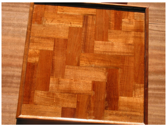
Figure 2.2: A sample of floor parquet made from Prosopis juliflora timber (KEFRI)