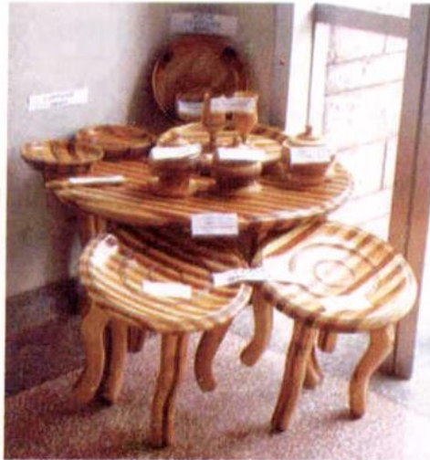
Varieties of fancy items produced from left-over wood at Karura Forest Products Research Centre

The Centres are managed by Centre Directors who report to the Deputy Director (R&D).