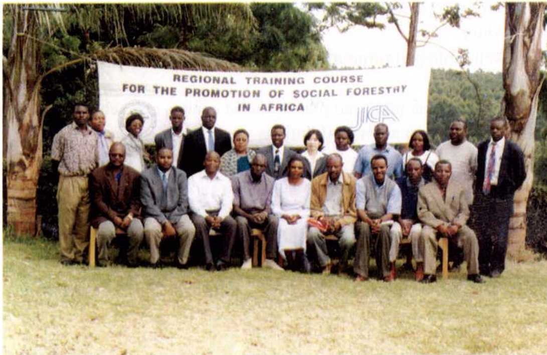
Participants of 2003 Regional Social Forestry Training group