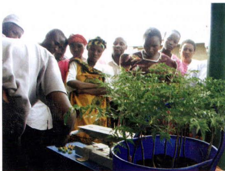
Farmer training on handling and raising mukau seed and seedlings

Two other programmes, namely, the Service Programme and Networks and Partnership, support the core research programmes. The Service Programme is headed by an Assistant Director responsible for outreach training, tree seed production and information documentation and dissemination. The Networks and Partnership Programme is co-ordinated by a National Coordinator/Assistant Director.