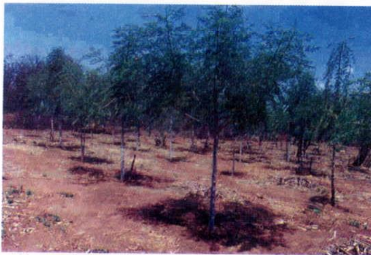
Melia volkensii (Mukau) Plantation in Kitui