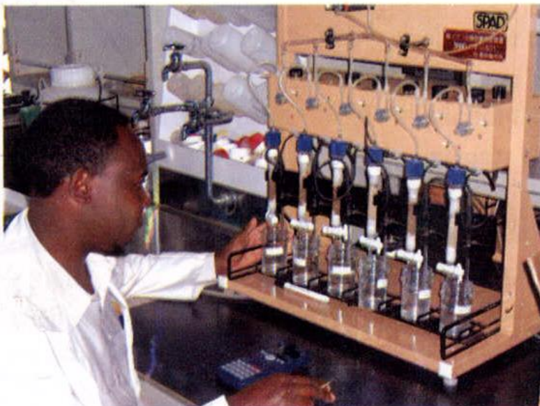
Soil chemical analysis at Muguga Regional Research Centre laboratory