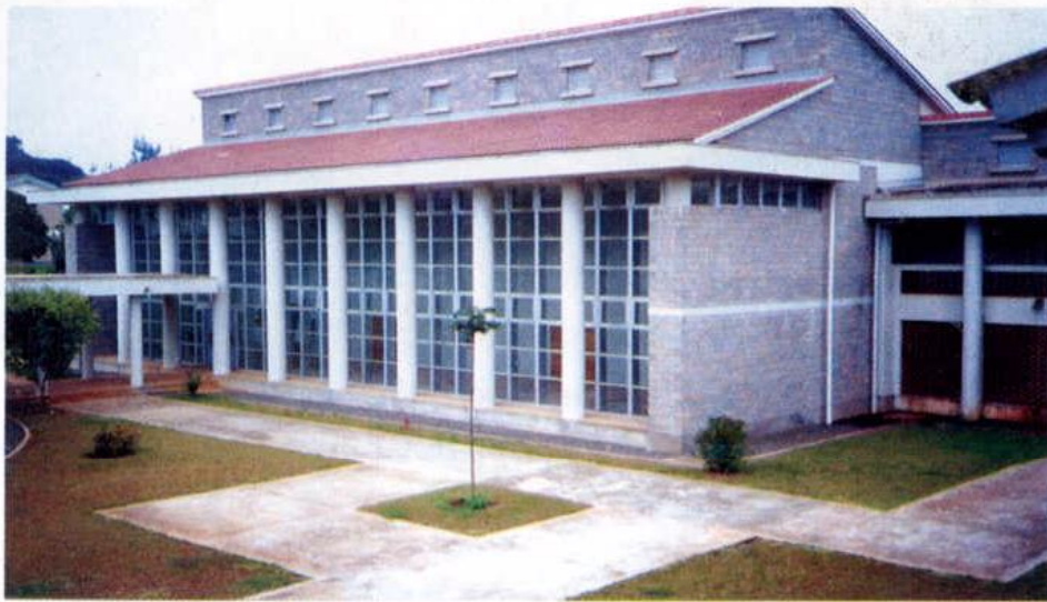
Social Forestry meeting auditorium at KEFRI headquarters, Muguga