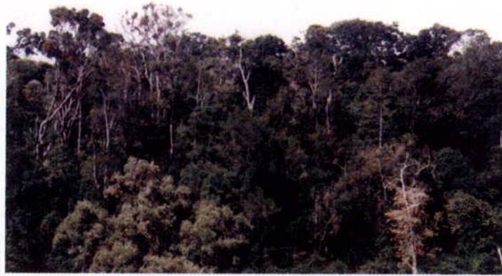
A well conserved natural forest