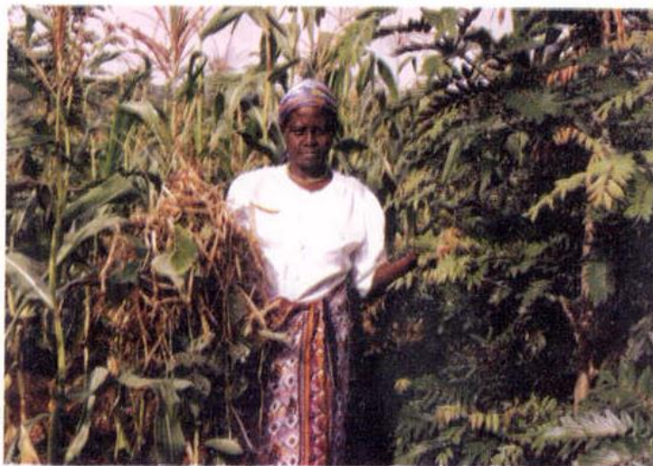
Improved maize production using integrated soil fertility enhancing tree species

Within the programmes, research projects are developed and implemented through multi-disciplinary teams of scientists based at Regional Centres. The Regional Centres are responsible for implementation of research projects through field centres and collaborators, particularly those within their localities.