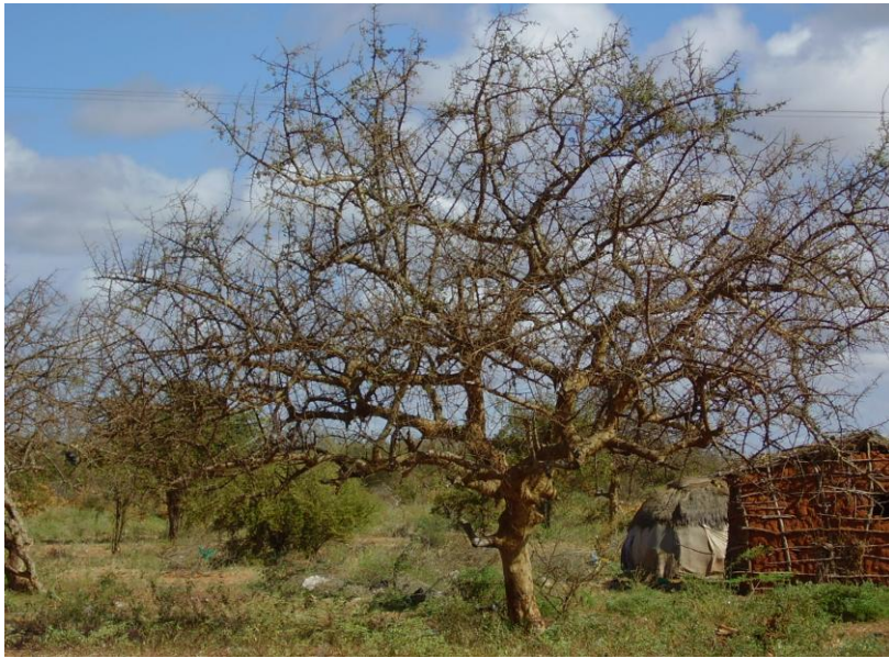
Figure 3. The tree of Commiphora holtziana .