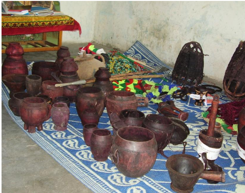
Figure 4. The use of natural dyes in handicraft.

them against rotting (Figure 4). The main dye and tannin types used were natural dyes (67.1%) and both natural and artificial dyes (30%). The natural dyes sources were accessible to 44.3% respondents who could harvest and collect them within one hour or less walking distance, while the rest had to walk more than an hour. The natural dyes were used mostly on handicraft products (92.9%)