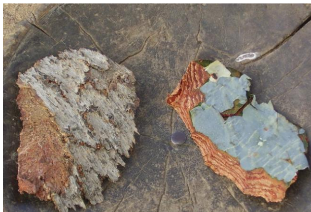
Figure 5. Debarked trees used in dye production.

play an important role in adding value to the handicraft products of these people hence enhancing their income while maintaining their cultural values.