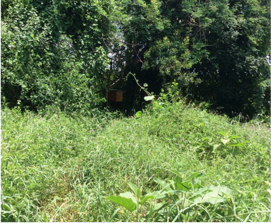
Fig. 2.3 Bee-keeping in the forest

Each of the modern beehives produces about 15 kg of honey per harvest, worth 60 USD. This is an increase as compared to the 3 kg per harvest of the traditional log hives that were being used before the groups switched to modern beehives. The traditional log hives fetched only 12 USD per harvest, about 20% of what the modern beehives are generating for the local community members engaged in bee-keeping. The total income from honey per harvest is 7920 USD per harvesting season. There are 85 households involved in bee-keeping, and hence the income per household generated from honey per season is 93.20 USD. There are three harvesting seasons per year; accordingly, this translates to a household income of 279.60 USD annually. This household income from honey is substantial considering the fact that bee-keeping is not a full-time activity, and the majority of households largely depend on small-scale farming as their main economic activity.