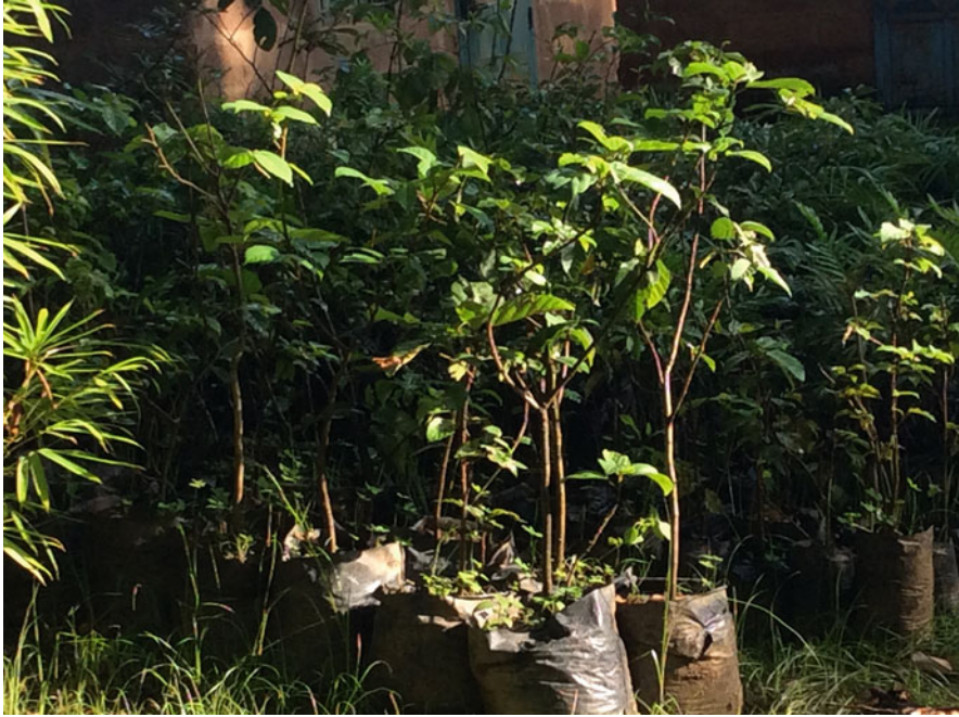
Fig. 2.2 Community tree nursery at Chawia forest

seedling, while exotic species are 0.10 USD per seedling. The community nurseries generate about 4000 USD from the sale of indigenous trees seedlings and 3200 USD from exotic tree species' seedlings per year. In total, the three community nurseries generate 7200 USD annually.