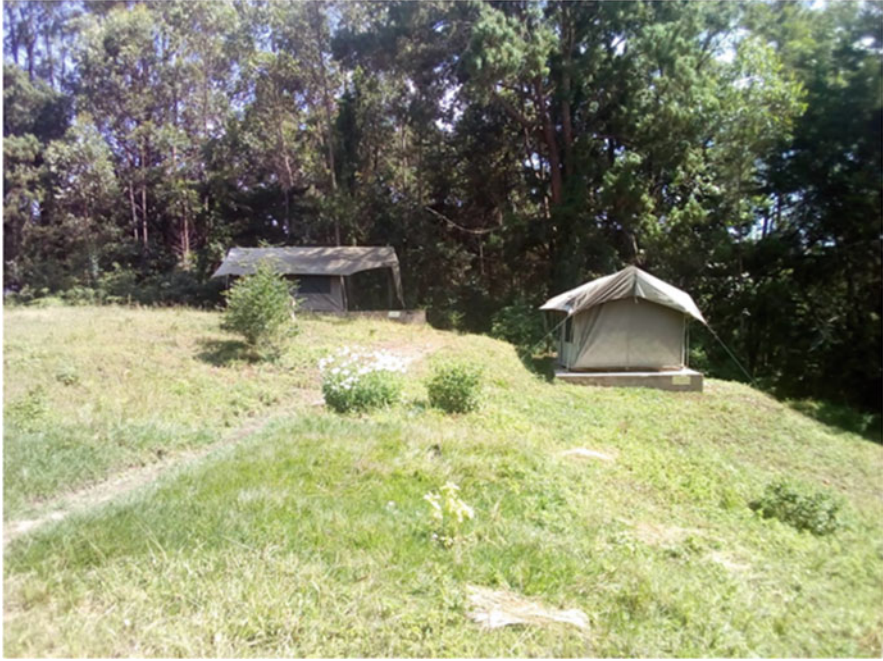
Fig. 2.4 Tourist campsite at Ngangao forest

to biodiversity conservation. Furthermore, maintaining the high population of bees in the Taita Hills landscape promotes efficient pollination in the agricultural systems where the forests are embedded, leading to conservation of agrobiodiversity for traditional crops such as sorghum, millet, pigeon peas, green grams, and cowpeas, which also enhances food self-sufficiency.