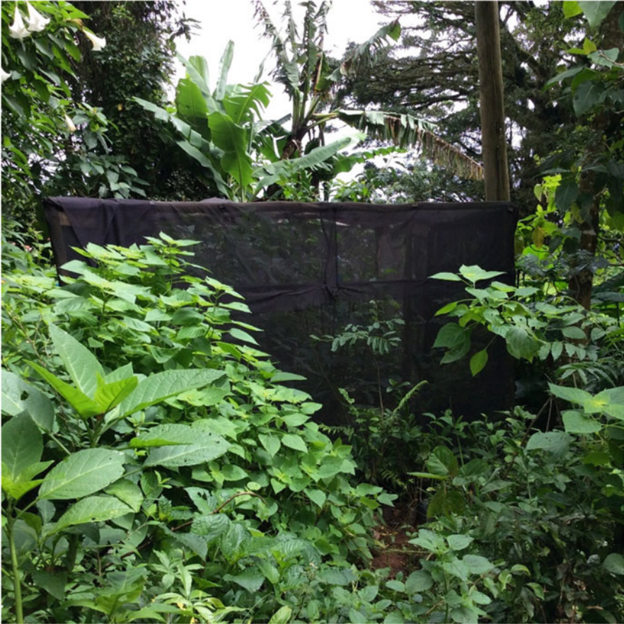
Fig. 2.5 Butterfly farming on the edge of Chawia forest

swallowtails and pansies are also found in Chawia forest. On average, the group sells about 200 butterfly pupae per month, translating to about 110 USD, or 1320 USD annually. Hence, each member receives 13.80 USD per month, an income that members of the community group use to supplement other income sources in order to meet their livelihood needs without engaging in destructive activities like illegal harvesting of trees for wood products such as timber and charcoal. The pupae are sold to the Kipepeo Butterfly Centre in Gede Kilifi County, which in turn exports to overseas markets, mainly in Europe, for live exhibits. Although the group rears two butterfly species endemic to Taita Hills forests ( Cymothoe teita and Papilio desmondi teita ), they do not sell their pupae. Rather they release the adults of the endemic butterfly species into the wild to increase their population and conserve the existing biodiversity of butterflies, which are important pollinators in the natural forests and agro-ecosystems in Taita Hills. Consequently, butterfly farming enables