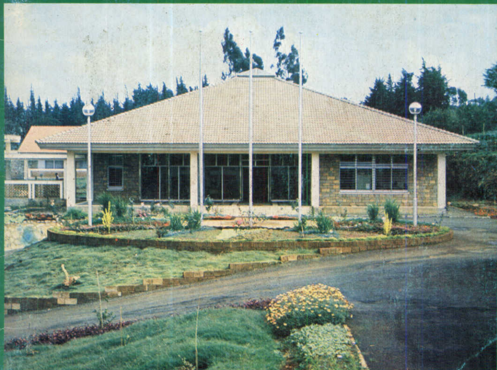
Kenya Forestry Research Institute (KEFRI) Headquarters - Muguga